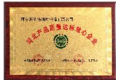
河北產品質量達標放心企業 Hebei product quality qualified trustworthy enterprises