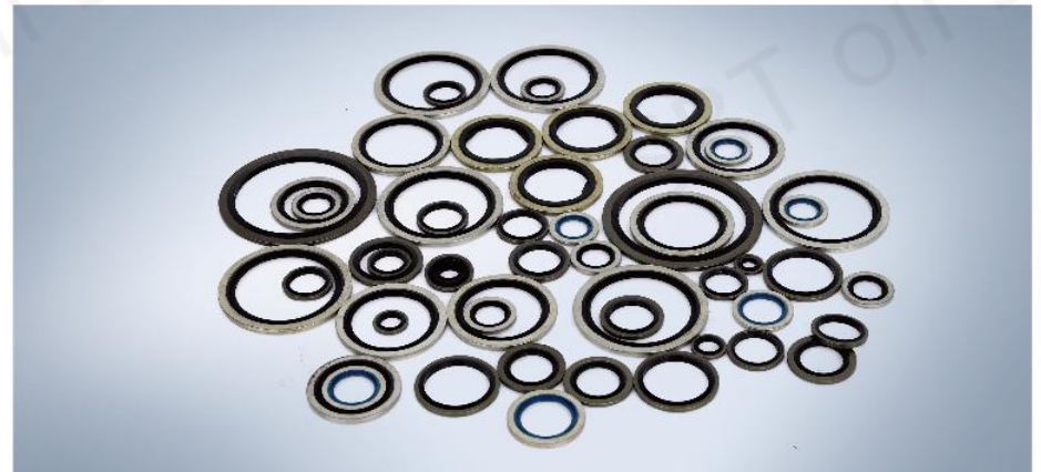
➤ Bonded seal 組合墊片