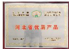
河北省優質產品 Hebei quality products