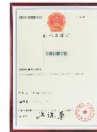
蘇伯特品牌商標證 SBT brand trademark