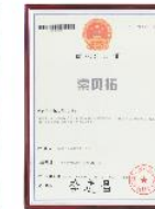
蘇伯特旗下品牌 SBT's brand