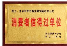
消費者信得過單位 Consumer trustworthy enterprise