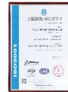
質量管理體系認證證書 Quality management system certification