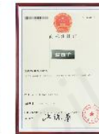
SBT品牌商標證 SBT brand trademark