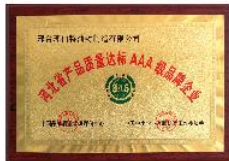
河北省產品質量達標AAA級品牌企業 Hebei product quality qualified AAA brand enterprise