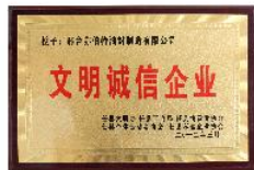
文明誠信企業 Civilized and honest enterprise