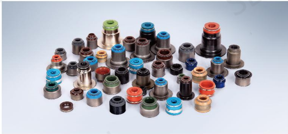
➤ Valve oil seal 氣門油封