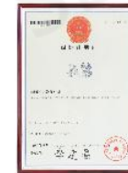
蘇伯特旗下品牌 SBT's brand