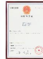
蘇伯特旗下品牌 SBT's brand