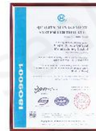
質量管理體系認證證書 Quality management system certification

今後，蘇伯特每次開會或接待，抬眼都能看到這些榮譽獎牌，從而不斷提醒大家：成績和榮譽僅僅代表過去，新的班子集體要以此為鞭策和激勵，不斷奮發進取，開拓創新，爭取獲得更加優異的成績，真正做一切為了保證客戶的利益，為了保證不濶漏的純正品質而努力。