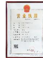
營業執照 Business license