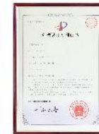
外觀設計專利證書 Design patent certification