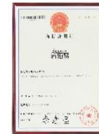
蘇伯特品牌商標證 SBT brand trademark