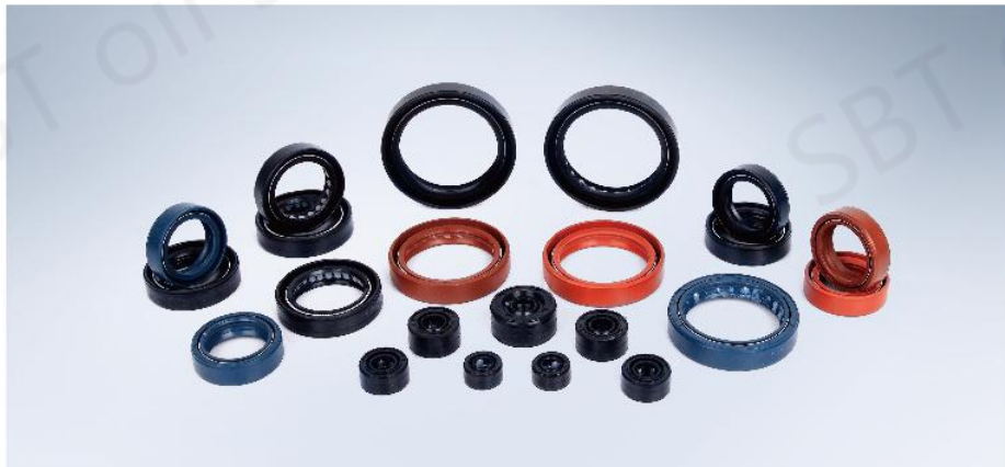
➤ Reciprocating oil seal 往復油封