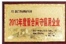
2013年度重合同守信用企業 2013 contract and credit trustworthy enterprises